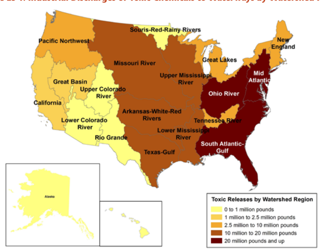
Figure ES-1. Industrial Discharges of Toxic Chemicals to Waterways by Watershed Region

• Watersheds receiving the highest volumes of toxic pollution were the Lower Ohio River-Little Pigeon River (Indiana, Illinois and Kentucky), the Upper New River (Virginia) and the Middle Savannah River (Georgia and South Carolina). (See Table ES-3.)