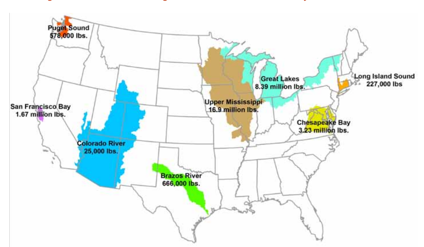
Figure ES-2. Industrial Discharges of Toxic Chemicals to Nationally Iconic Watersheds