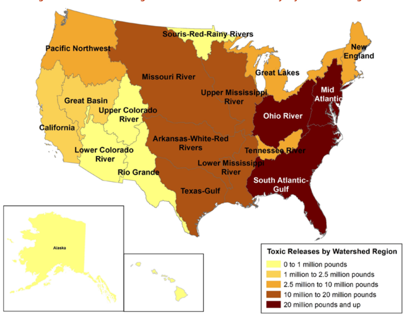
Figure 2. Industrial Discharges of Toxic Chemicals to Waterways by Watershed Region

Our nation's iconic waterways are still threatened by toxic pollution – with polluters discharging chemicals into the following watersheds: Great Lakes (8.39 million pounds), Chesapeake Bay (3.23 million pounds), Upper Mississippi River (16.9 million pounds), and Puget Sound (578,000 pounds), among other national treasures. (See Figure 3.)